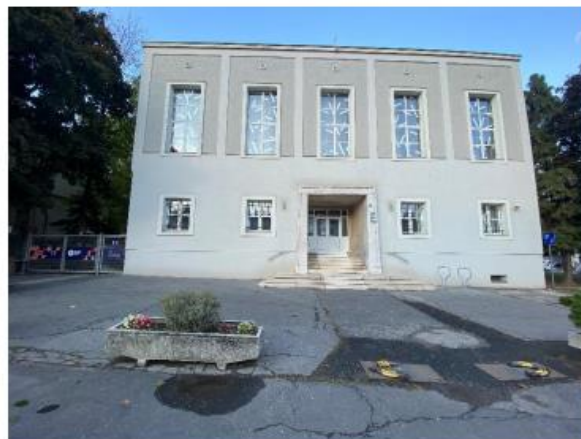
Figure 2 Entrance to building 'E'