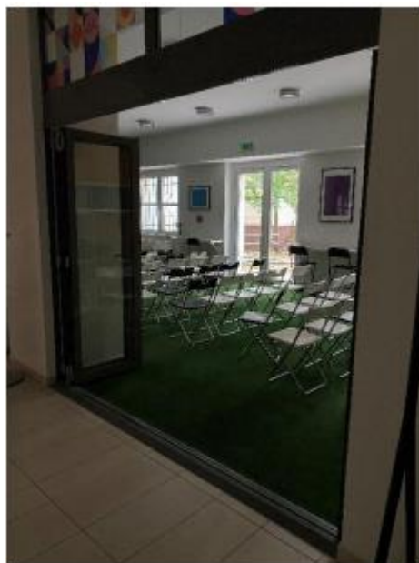
Figure 6: The back door of the Pannon Community Hub

The room has three doors to the ground floor of the building, all of them are accessible, but the rear door is the widest and the most easily accessible.