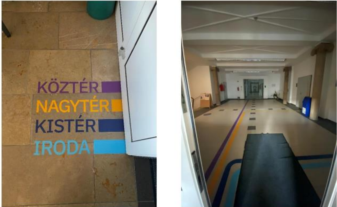
Figure 7 Markings, foreground

From the main entrance, coloured stripes run towards the 4 main rooms of the building, the Community Space (Köztér), the Project Room (Nagyter), the Volunteer Room (Kister) and the office (Iroda). These markings run right up to the door, where the names of the rooms are also written.