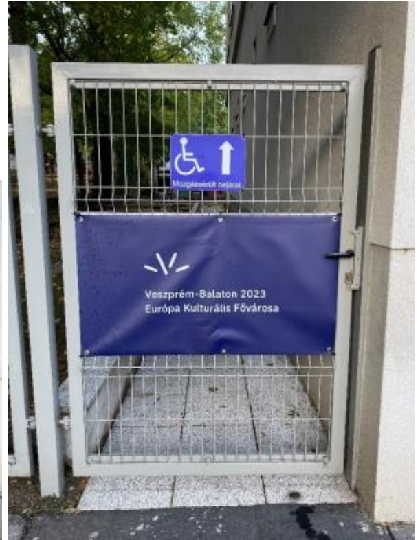
Figure 3 Accessible entrance

Once through the gate, a long sloping ramp leads up to the terrace, which is furnished with garden furniture.