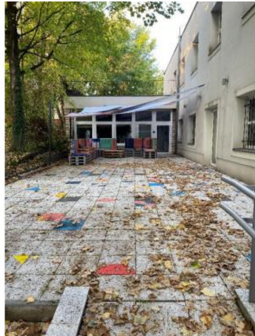
Figure 4 Garden