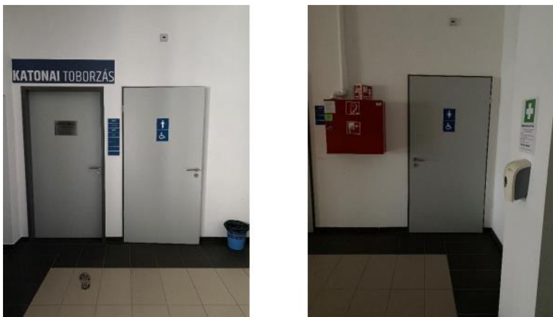
Figure 8 Accessible toilets

The building has accessible toilets. They are located to the left of the main entrance. Important to note though, that the 1st floor of Building 'E' can not be accessed by elevator. The 1st floor is not accessible.